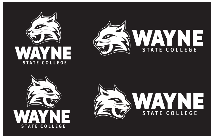
Wildcat One-Color Reverse Logo

G:\wscdocuments_and_forms\College Relations\~Wayne State College Logos\General WSC Logos