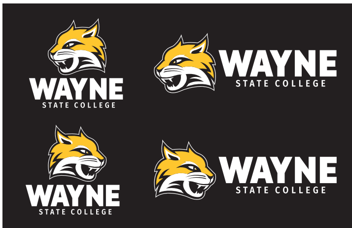
Wildcat Reverse Logo