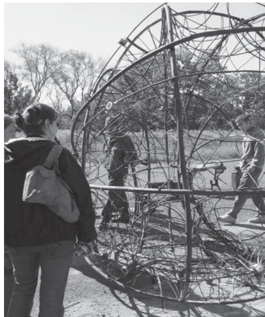
The WSC Department of Art and Design's fall trip to Minneapolis, Minn. included museum visits, gallery walks, and guided tours.

The fall 2005 semester trip by the Department of Art and Design to Minneapolis, Minn. included museum visits, gallery walks, and guided tours. A total of 24 WSC art and design students attended the trip, which included tours of the Purcell-Cutts House, The Walker Art Center and Sculpture Garden, the Minneapolis Institute of Art, the Franconia Sculpture Park in Shafter, and galleries throughout the city.