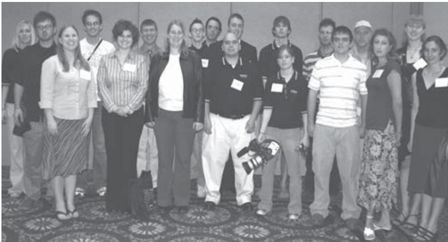
The Wayne Stater, the WSC student newspaper, earned the overall excellence award for the best small-college newspaper at the Nebraska Collegiate Media Association's Golden Leaf Awards presentations held in April.

WSC student broadcast media, KWSC-FM radio (K92) and KWSC-TV, also received awards. The radio station earned honors in eight of the 11 awarded categories, including six first-place awards, three second-place and one honorable mention. Two entries from KWSC-TV also received first- and second-place awards. The Nebraska Collegiate Media Association promotes journalism and electronic media studies to foster a closer relationship between mass communication programs at member colleges, encourage high standards of media ethics, and to recognize outstanding student achievement.