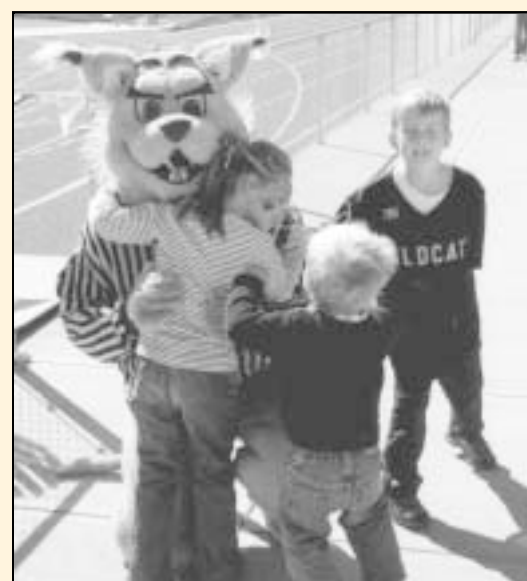
A popular character at the football game was Willy, shown here greeting young Wildcat fans.