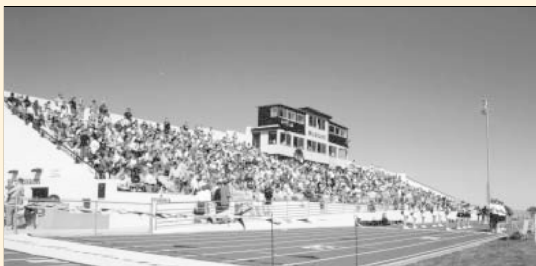
A full house was on hand as the Wildcat football team took on Northern State on Saturday.