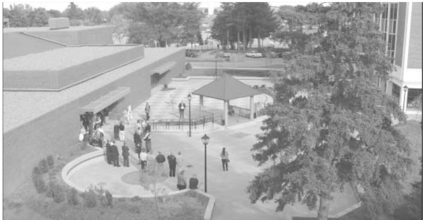
The Hoffbauer Plaza, located between the Student Center and Bowen Hall, promises to be a popular gathering spot for the entire campus. Above, individuals gather for the plaza dedication on Oct. 3.