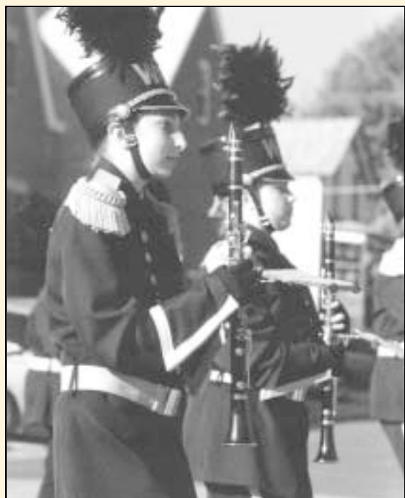
The WSC marching band participated in the Homecoming parade and performed during half-time of the football game.