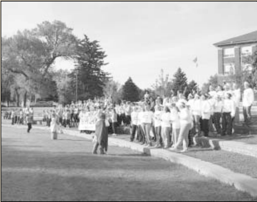
The Greek Olympics, a long-time tradition at Wayne State College, were held on Friday afternoon in the Willow Bowl.