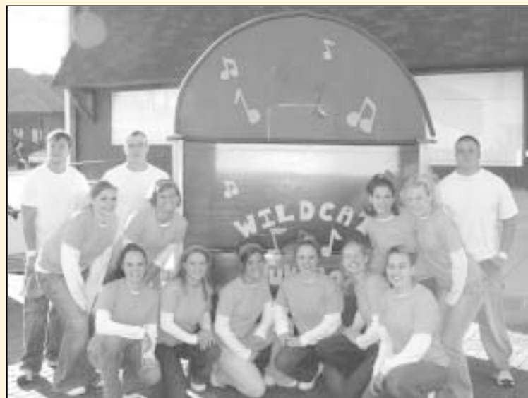
Wildcat cheerleaders' parade entry, complete with a motorized juke box, built on the parade theme of "Blast from the Past."